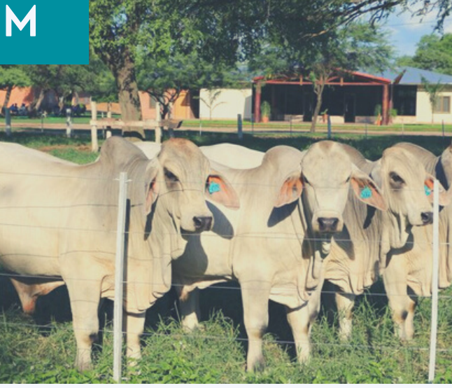
The itinerary may be subject to minor modifications.

Founded in 1947 with the help of an American institution to promote agricultural development in the Central Chaco area. Site of the first trials to enable bush land and use the establishment of pastures, the oldest protection strips are on this site. Today it is an animal genetics center, it produces bovine and equine breeders.