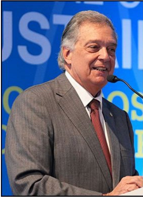
Fernando Mattos Costa Uruguay Minister of Livestock, Agriculture, and Fisheries